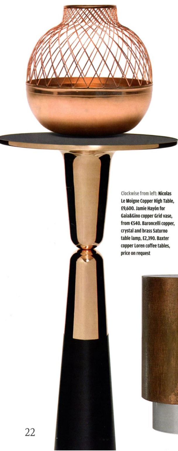
Clockwise from left: Nicolas Le Moigne Copper High Table, £9,600. Jamie Hayón for Gaia&Gino copper Grid vase, from €540. Barocelli copper, crystal and brass Saturno table lamp, £2,390. Baxter copper Loren coffee tables, price on request

The warm glow and jewel-like qualities of the “red metal” are now being showcased in innovative ways and luring design aficionados away from industrial-looking steel, says Nicole Swengley