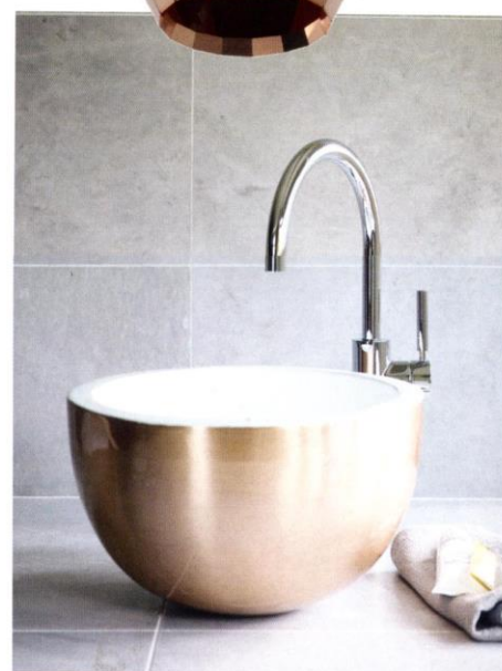
Clockwise from above: Hunting & Narud copper mirrors, from £5,700. Keir Townsend copper- and brass-clad sideboard, from £9,237. David Derksen copper pendant light, from £545. Fired Earth copper and enamel Aphrodite Cyprus basin, £945. Tom Dixon copper and cast-iron Base Copper floor lamp, £845. J&L Lobjmeyr and Studio Formafantasma copper vessel filter, £1,600, and silica vessel, €680