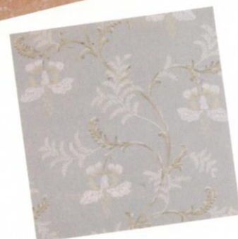
RIGHT Bellflower old blue wallpaper, £62 a roll, Colefax and Fowler