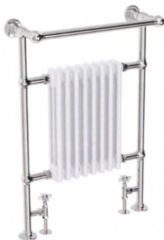
ABOVE Savoy traditional radiator with crosshead valves, £209.94, Victorian Plumbing