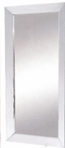
ABOVE Veneto mirrored glass rectangular mirror, £484, Alexander & Pearl