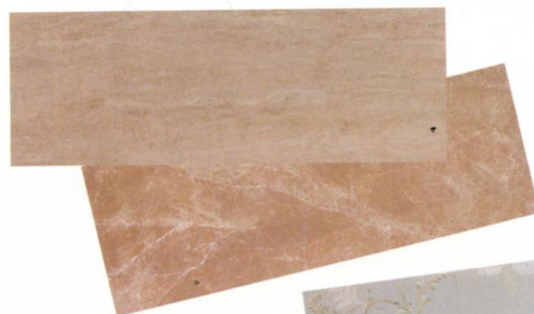
ABOVE Travertino Medici ceramic wall tile (45 x 120cm); Venezia Topo ceramic wall tile (45 x 120cm), both £70.96 a square metre, Porcelanosa