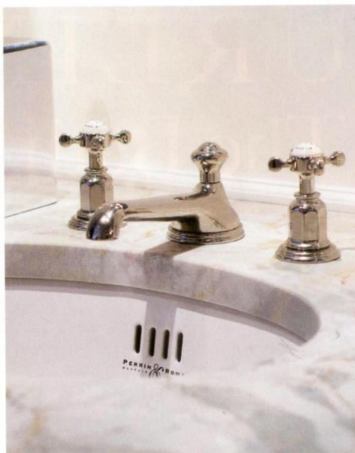
ABOVE Three-hole basin set with low-profile spout and crosshead handles in chrome, £456.48, Perrin & Rowe