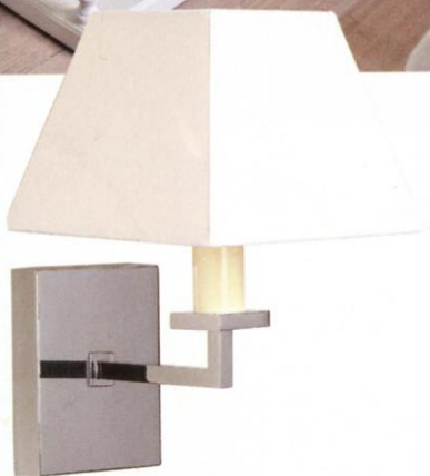
ABOVE Norfolk bathroom rectangular wall light, £297.60; Tapered square pale cream card lampshade, £32.40, both from Vaughan Designs

Combining country-house style with modern touches need not be as complex as it might first appear. The room shown (opposite and above left), created by interior designer Emma Sims Hilditch, cleverly brings together traditional elements such as polished chrome period fittings and classic turned leg furniture, with the clean lines of wide-bevelled mirrors and elegant wall lights. Considered use of colour with a harmonious palette incorporates the natural hues of the tile-lined walk-in shower, alongside the calm tones of classic floral-design wallpaper. A white base tone draws together key elements, whilst providing accent touches such as porcelain lever handles, and an assortment of pillar candles in glass lanterns shows attention to the smallest details. ▶