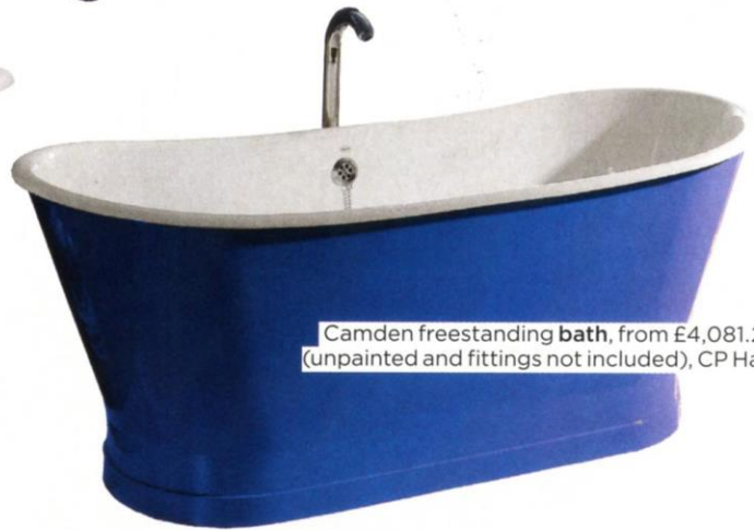
Camden freestanding bath, from £4,081.20 (unpainted and fittings not included), CP Hart