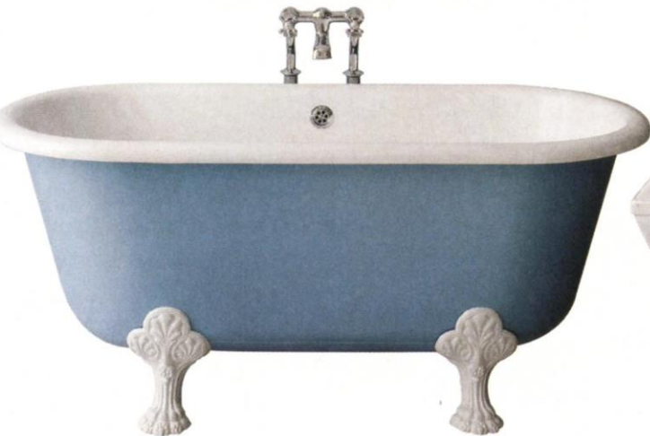
French Empire freestanding bath, £5,400 (fittings not included), Catchpole & Rye