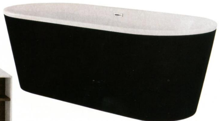
Windsor Imperial freestanding bath, £499.94, Victorian Plumbing