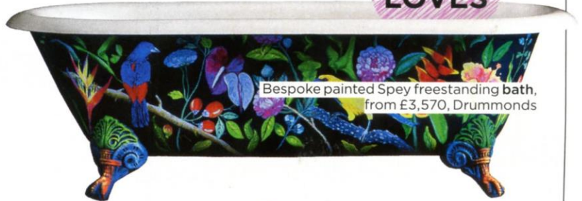
Bespoke painted Spey freestanding bath, from £3,570, Drummonds