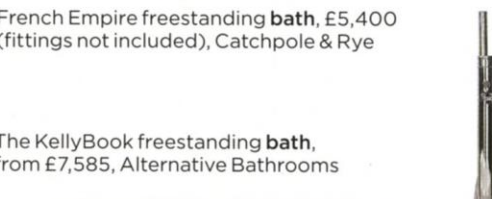
The KellyBook freestanding bath, from £7,585, Alternative Bathrooms