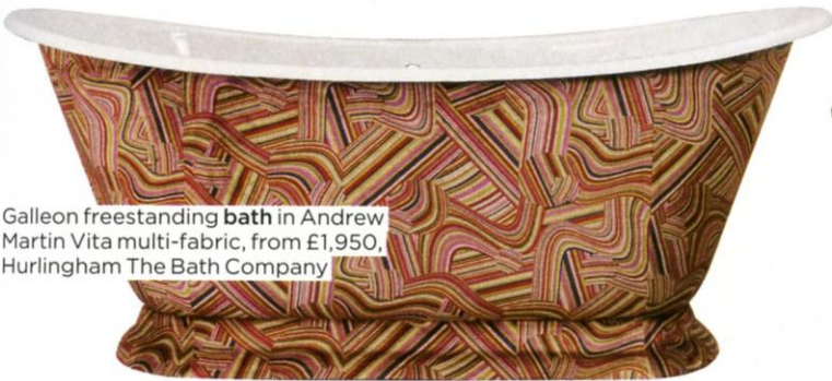
Galleon freestanding bath in Andrew Martin Vita multi-fabric, from £1,950, Hurlingham The Bath Company