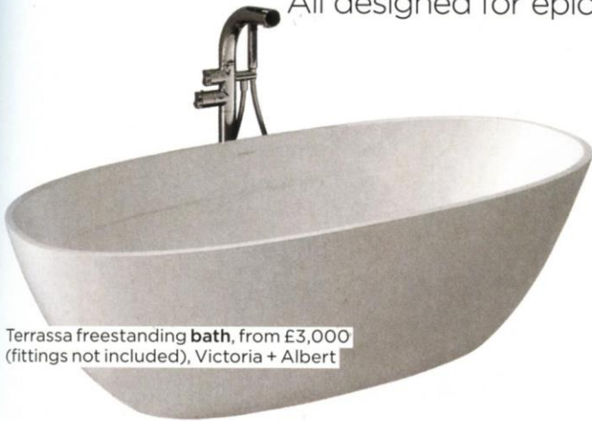
Terrassa freestanding bath, from £3,000 (fittings not included), Victoria + Albert