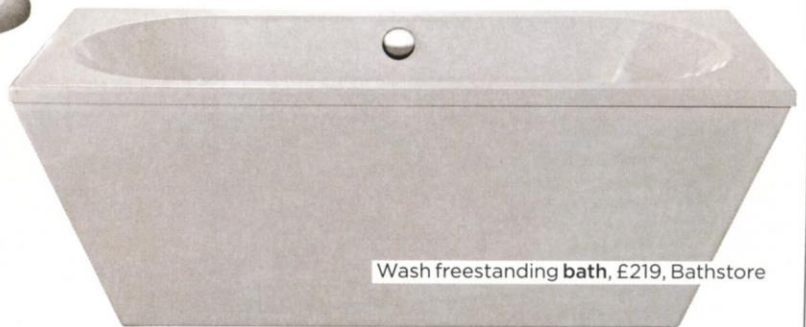
Wash freestanding bath, £219, Bathstore