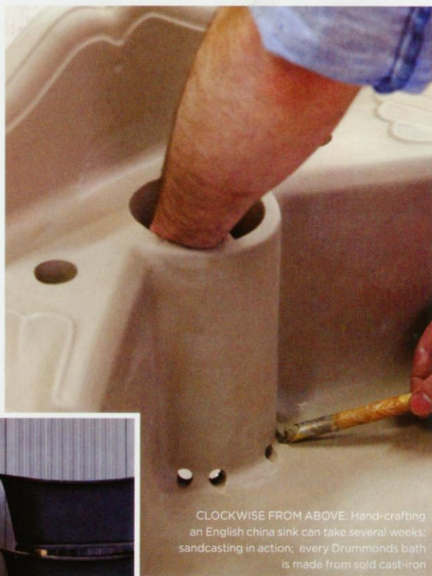
CLOCKWISE FROM ABOVE: Hand-crafting an English china sink can take several weeks; sandcasting in action; every Drummonds bath is made from solid cast-iron

Likewise, all basins are manufactured in the finest English china clay and are finished and glazed by hand, so no two pieces are the same. A basin can take several weeks in production, with the firing process taking up to two weeks for a large basin. It is paramount that this stage is undertaken with care, as it has a huge affect on the final durability.