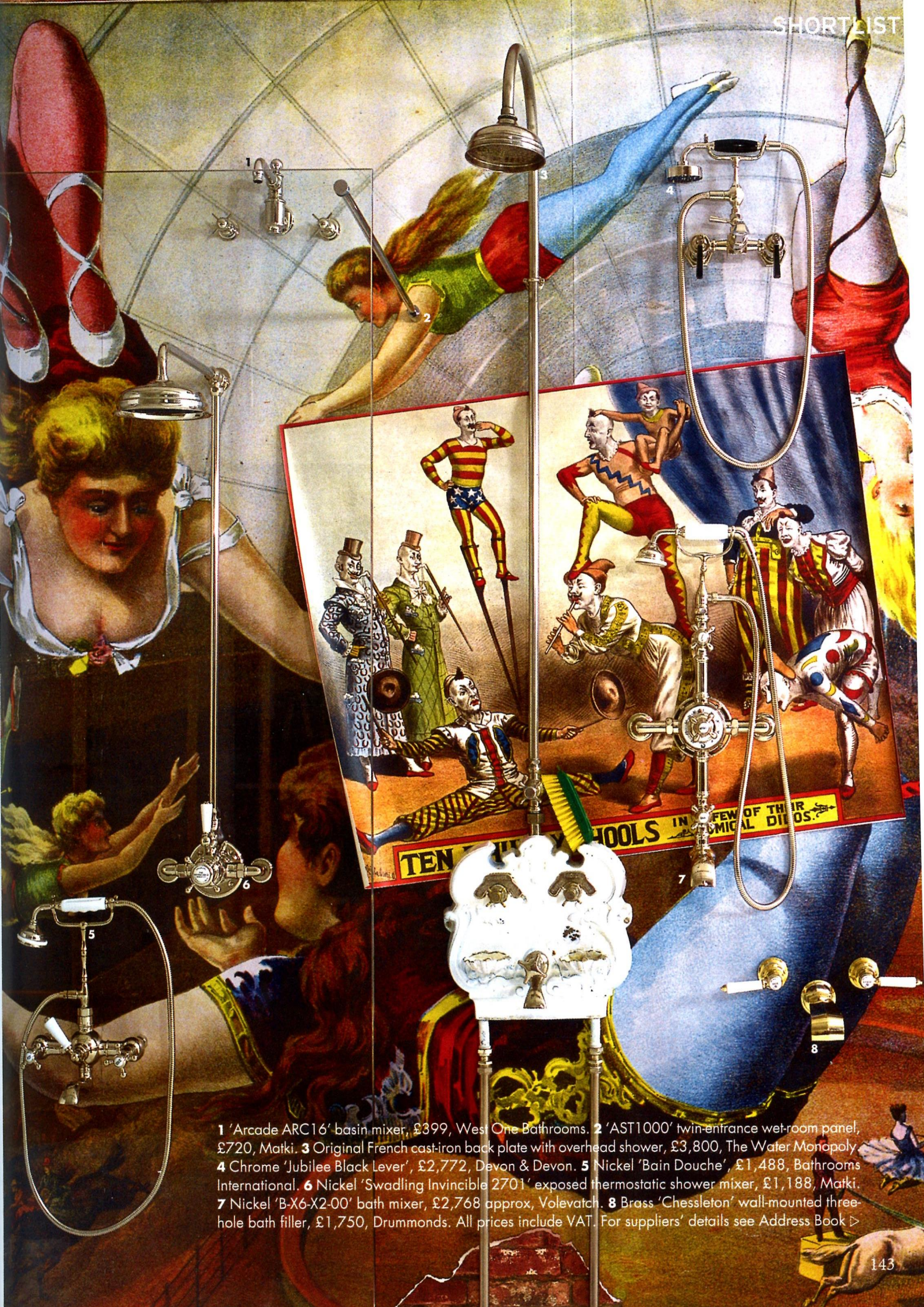
1 'Arcade ARC16' basin mixer, £399, West One Bathrooms. 2 'AST1000' twin-entrance wet-room panel, £720, Matki. 3 Original French cast-iron back plate with overhead shower, £3,800, The Water Monopoly. 4 Chrome 'Jubilee Black Lever', £2,772, Devon & Devon. 5 Nickel 'Bain Douche', £1,488, Bathrooms International. 6 Nickel 'Swadling Invincible 2701' exposed thermostatic shower mixer, £1,188, Matki. 7 Nickel 'B-X6-X2-00' bath mixer, £2,768 approx, Volevatch. 8 Brass 'Chessleton' wall-mounted three-hole bath filler, £1,750, Drummonds. All prices include VAT. For suppliers' details see Address Book >