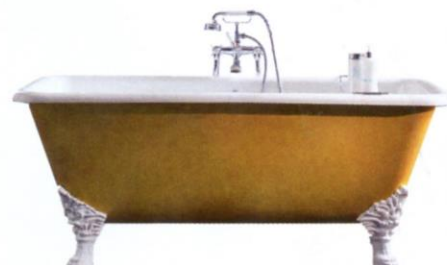
'Hanover' cast iron bath (yellow), from £1,258.44, from Aston Matthews. astonmatthews.co.uk