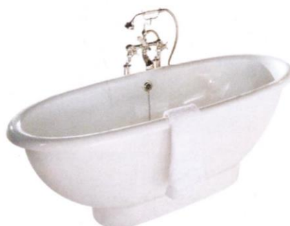
'Leighton' polymarble freestanding bath, from £2,599, from Thomas Crapper. thomas-crapper.com