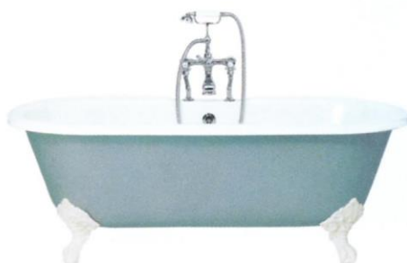
'Versailles' enamelled cast iron bath (blue grass), £1,975, from Fired Earth. firedearth.com