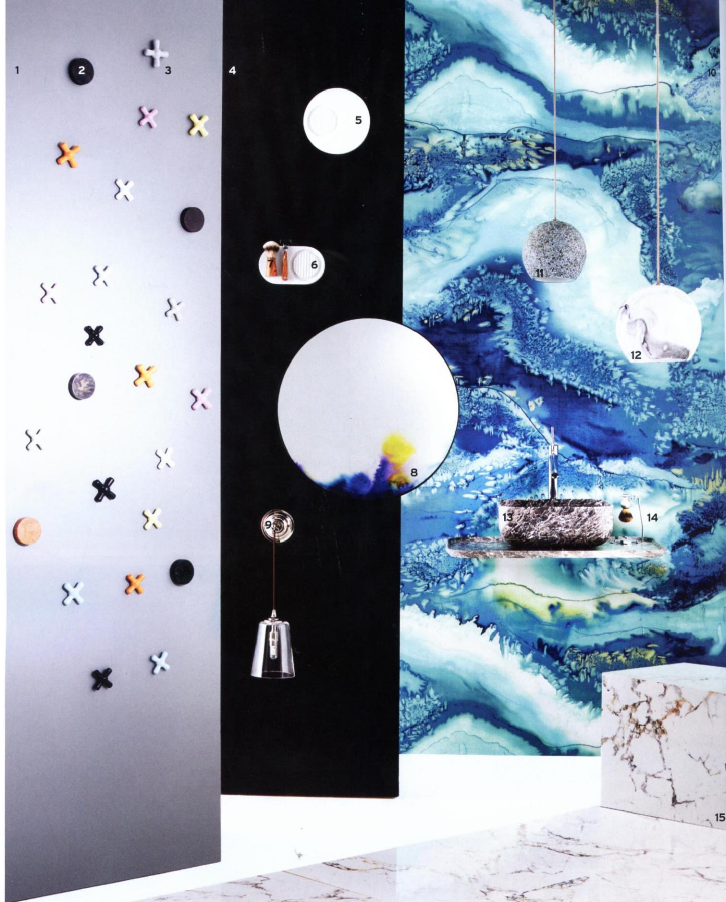
1 'Plummett No 272' paint , £43.50 for 2.5 litres modern emulsion, from Farrow & Ball. 2 'Zen' tap handles in finished metal, Bianco Carrara, Honey Onyx, Ice White Onyx and Nero Marquina, from £212 each, from The Watermark Collection. 3 'Rockwell' ceramic crossheads (white, black, grey, blue, green, orange and lilac), from £768 including taps and spout, from The Water Monopoly. 4 'Pitch Black' paint , £43.50 for 2.5 litres modern emulsion, from Farrow & Ball. 5 & 6 'Marmo' white Carrara marble round soap holder , £351.75, and soap dish , £285.80, from C P Hart. 7 'Zebrano' wooden shave set , £425, from Czech & Speake. 8 'Francis Grand' mirror with aluminum frame, 61cm diameter, £398, from Petite Friture. 9 'Dalby' pendant light with glass shade, 36.5 x 14.7 x 20.1cm, £378, from Drummonds. 10 'Obsidian' wallcovering (azurite), by Anthology, £225 a 300 x 140cm panel, from Wallpaper Direct. 11 'Asteroid' blown glass with nickel-plated brass pendant light (crusty grey) & 12 'Luna' pendant light (grey swirl), both 22 x 24.5cm, £1,440 each, from Porta Romana. 13 'Nahbi Bowl N 9' marble basin and tray , £3,696, from West One Bathrooms. 14 'Oxford and Cambridge' silver aluminium shave set and stand , £375, from Czech & Speake. 15 'Mimica Arabescato Oro Gloss' glass and porcelain tiles , from £76.50 a square metre, from Mandarin Stone. For suppliers' details, see Stockists page □