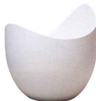
'Lunetta' Cristalplant freestanding bath, £8,080, from West One Bathrooms. westonebathrooms.com