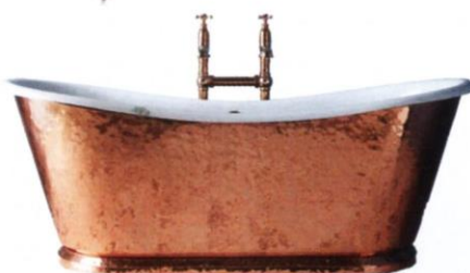
'Wye' cast iron bath with hammered copper finish, £10,140, from Drummonds. drummonds-uk.com