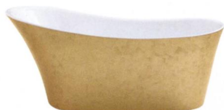
'Holywell' acrylic single-ended bath (gold effect), from £2,150, from Heritage Bathrooms. heritagebathrooms.com