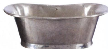
'Bateau' copper bath with brushed nickel finish, from £5,062, from William Holland Ltd. williamholland.com □