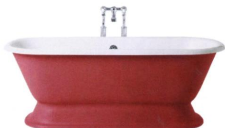
'Geminus Advance' Iso-Enamel cast stone bath (red), from £1,898, from The Albion Bath Company. albionbathco.com

BEAUTIFUL BATHS IN EYE-CATCHING DESIGNS, COLOURS AND INNOVATIVE MATERIALS