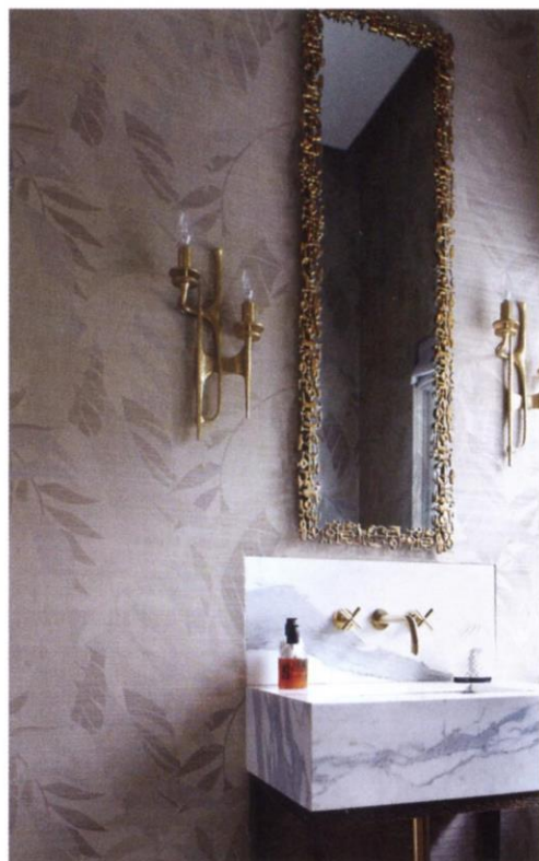
BRONZE AGE Designer Peter Mikic used wall sconces, an oversized mirror and 'Tara' taps from Dornbracht to striking effect. petermikic.com