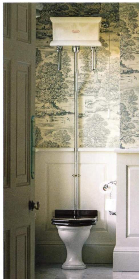
SIT PRETTY Panelling and wallpaper create the backdrop for this 'Brora WC Suite' and throne loo seat. The tall cistern adds drama. drummonds-uk.com