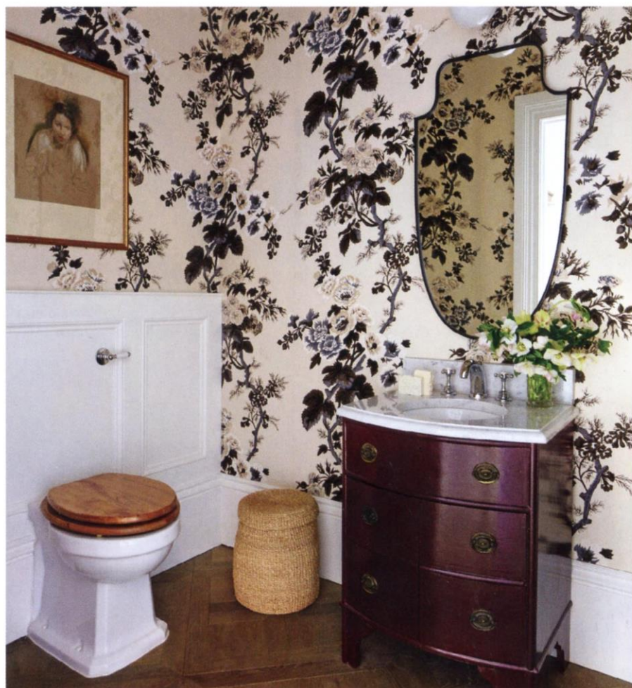
FRESH TAKE An antique chest of drawers from Ebay is reincarnated as a vanity unit with fresh lacquer and a basin and taps by C P Hart. The mirror from Vaughan reflects the pretty pattern of the 'Pyne Hollyhock' wallcovering by Schumacher. cphart.co.uk | fschumacher.com