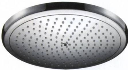
Croma 220 overhead shower head, £245, Hansgrohe at CP Hart