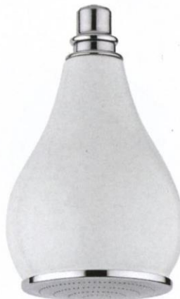
Tear Drop shower head, £390, Drummonds