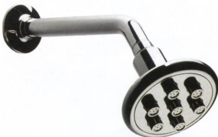
.25 shower head, approx £1,128, Waterworks