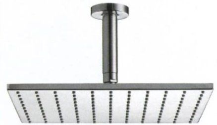
Cloud 350 shower head, £419, Bathstore