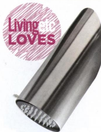
Amox 307 shower head, £324, Aston Matthews