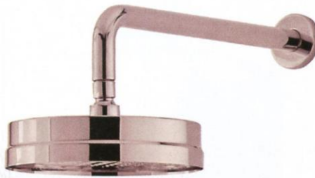
Hemsby shower head, £515 (including the controls), Heritage Bathrooms