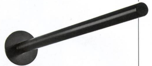
SO612 shower head, £1,573, MGS Milano at Grange Design