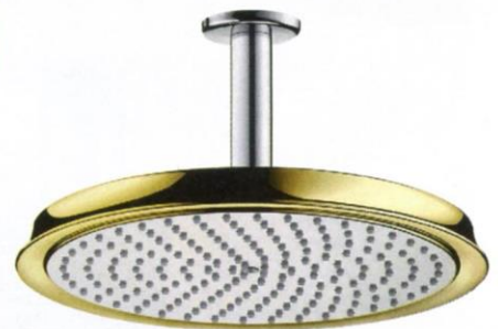
Raindance Classic 240 Air 1jet shower head, £800, Hansgrohe at Ripples