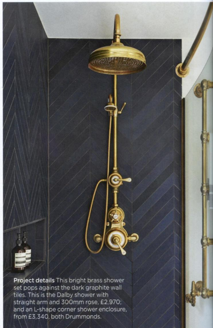
Project details This bright brass shower set pops against the dark graphite wall tiles. This is the Dalby shower with straight arm and 300mm rose, £2,970; and an L-shape corner shower enclosure, from £3,340, both Drummonds.