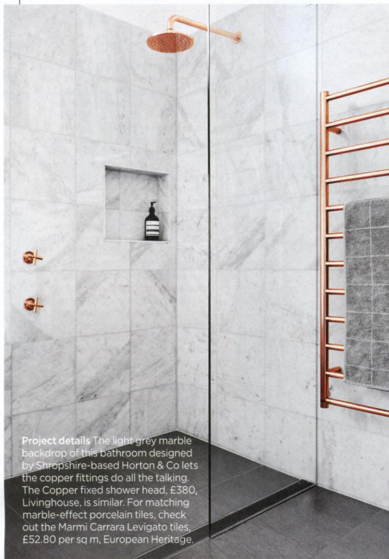
Project details The light grey marble backdrop of this bathroom designed by Shropshire-based Horton & Co lets the copper fittings do all the talking. The Copper fixed shower head, £380, Livinghouse, is similar. For matching marble-effect porcelain tiles, check out the Marmi Carrara Levigato tiles, £52.80 per sq m, European Heritage.