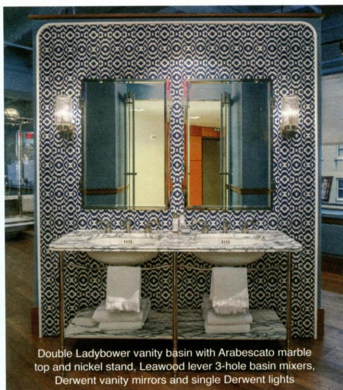
Double Ladybower vanity basin with Arabescato marble top and nickel stand, Leawood lever 3-hole basin mixers, Derwent vanity mirrors and single Derwent lights