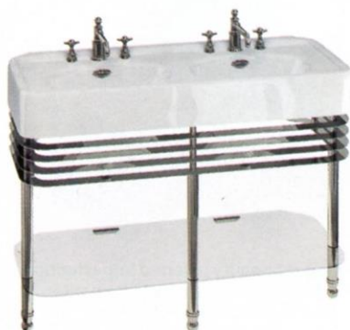
Get the Twenties look. Arc washstand, £2,299, Aston Matthews