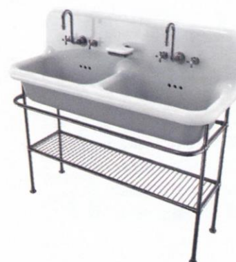
Channel the industrial vibe. Broadway double basin, £4,984, West One Bathrooms