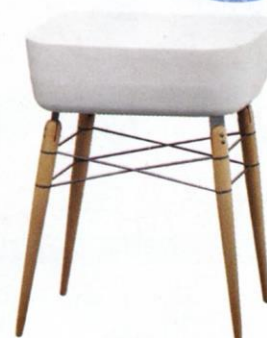
Go for a mid-century scheme. Ext Ray washstand and basin, from £1,364, CP Hart