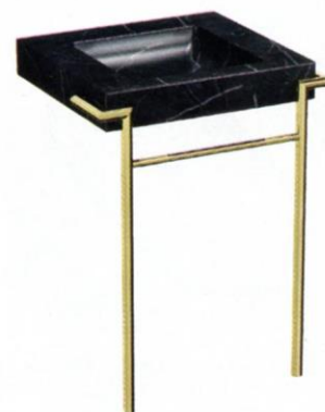
Make yours the crown jewel of the bathroom. Pinna Paletta console, £4,062, Laura Kirar for Kallista at West One Bathrooms