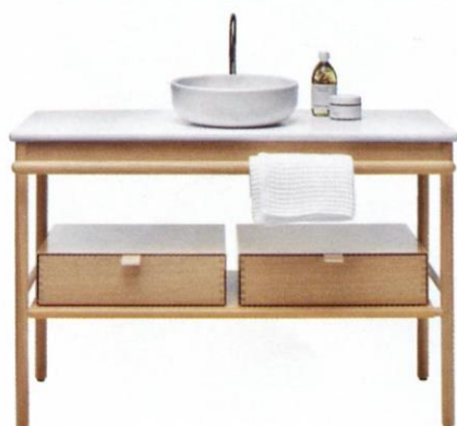
Take a cue from Shaker furniture. Mya washbasin with vanity unit, £3,993, Ripples