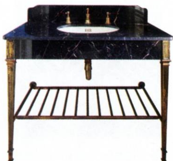
Combine antique brass and black marble for impact. Thames vanity, £5,642, Drummonds