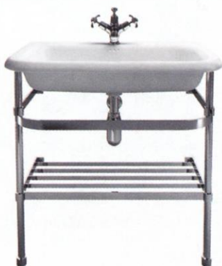
Less is more with this simple design. Large basin washstand, £669, Clearwater Baths at Pure Bathroom Collection