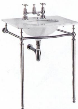
Marble never goes out of style. Carrara marble top and basin with basin stand, £1,144, Burlington