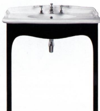
Introduce a feminine look with soft curves. Versailles console, £1,300, Fired Earth