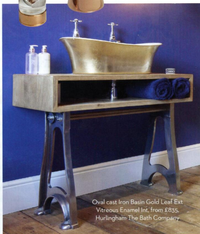
Oval cast Iron Basin Gold Leaf Ext Vitreous Enamel Int, from £835, Hurlingham The Bath Company