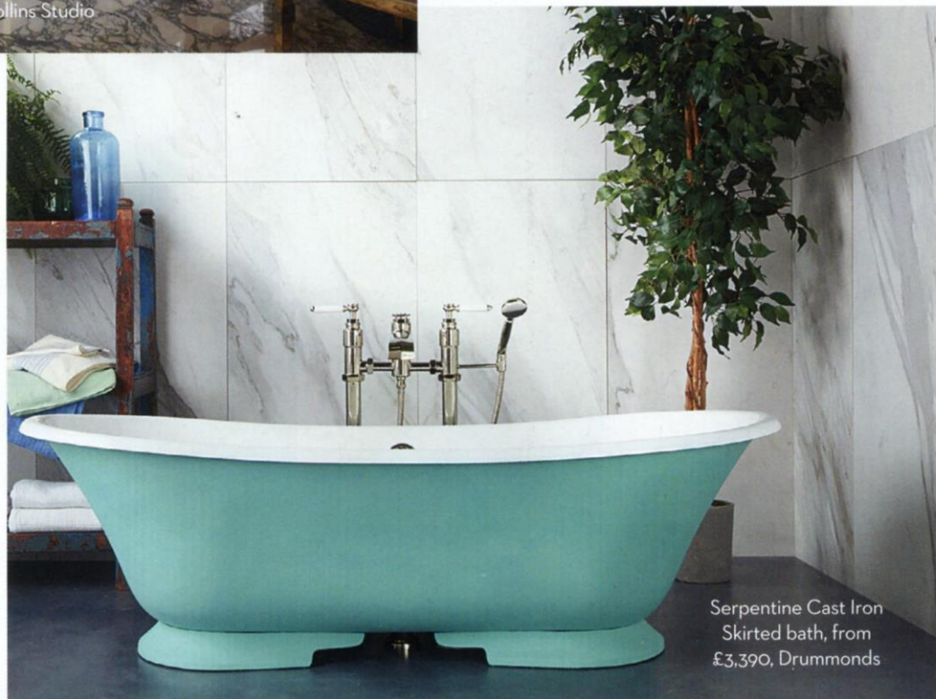
Serpentine Cast Iron Skirted bath, from £3,390, Drummonds