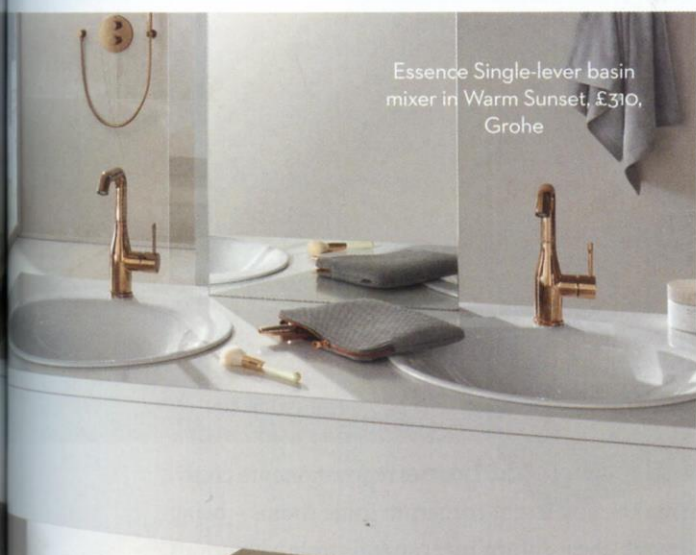
Essence Single-lever basin mixer in Warm Sunset, £310, Grohe