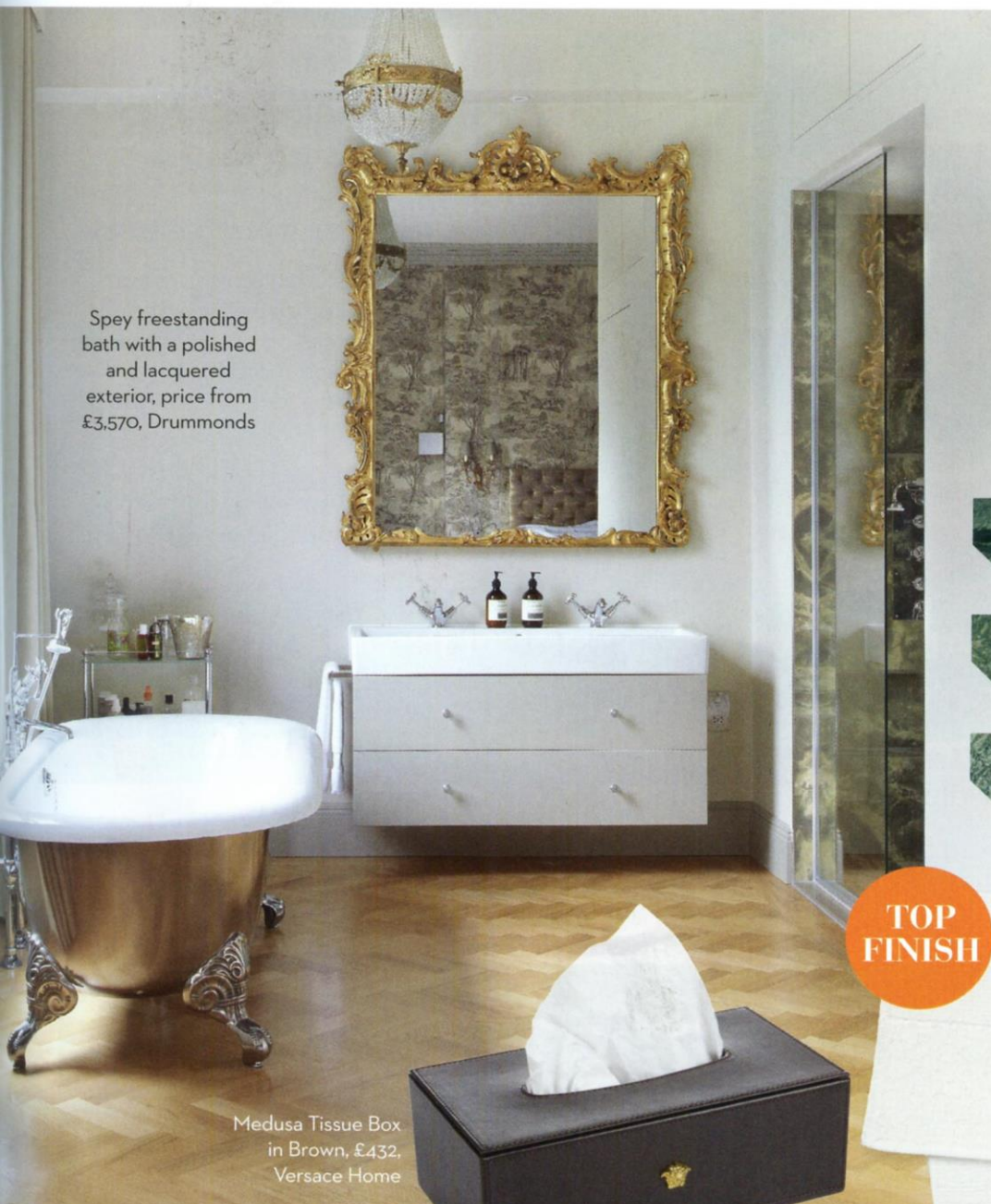
Medusa Tissue Box in Brown, £432, Versace Home

Spey freestanding bath with a polished and lacquered exterior, price from £3,570, Drummonds