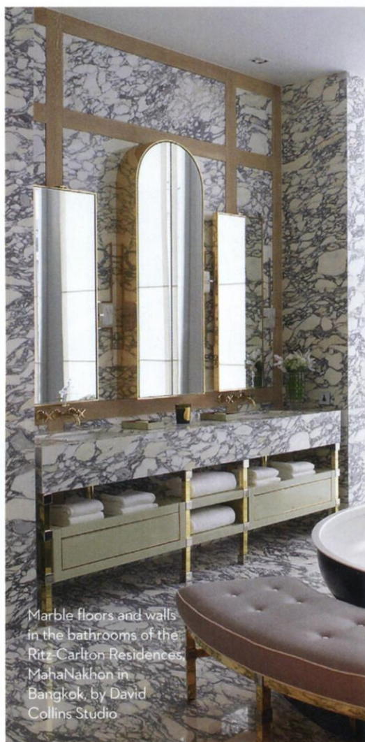
Marble floors and walls in the bathrooms of the Ritz Carlton Residences MahaNakhon in Bangkok, by David Collins Studio