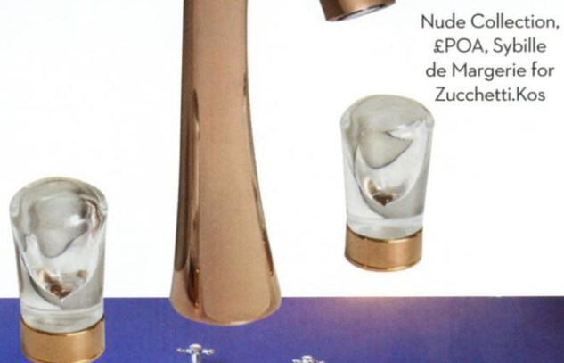
Nude Collection, £POA, Sybille de Margerie for Zucchetti.Kos