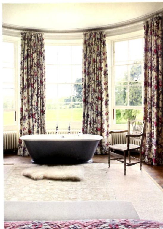
SNUG ( left ) Walls in Paint & Paper Library's 'Plum Brandy' set off curtains in 'Indian Pear' by Robert Kime. SPARE BEDROOM ( above ) His floral linen 'Rocca' frames a bath from Drummonds. HALL ( below left ) A 'Globe' lantern from Jamb suits the space perfectly