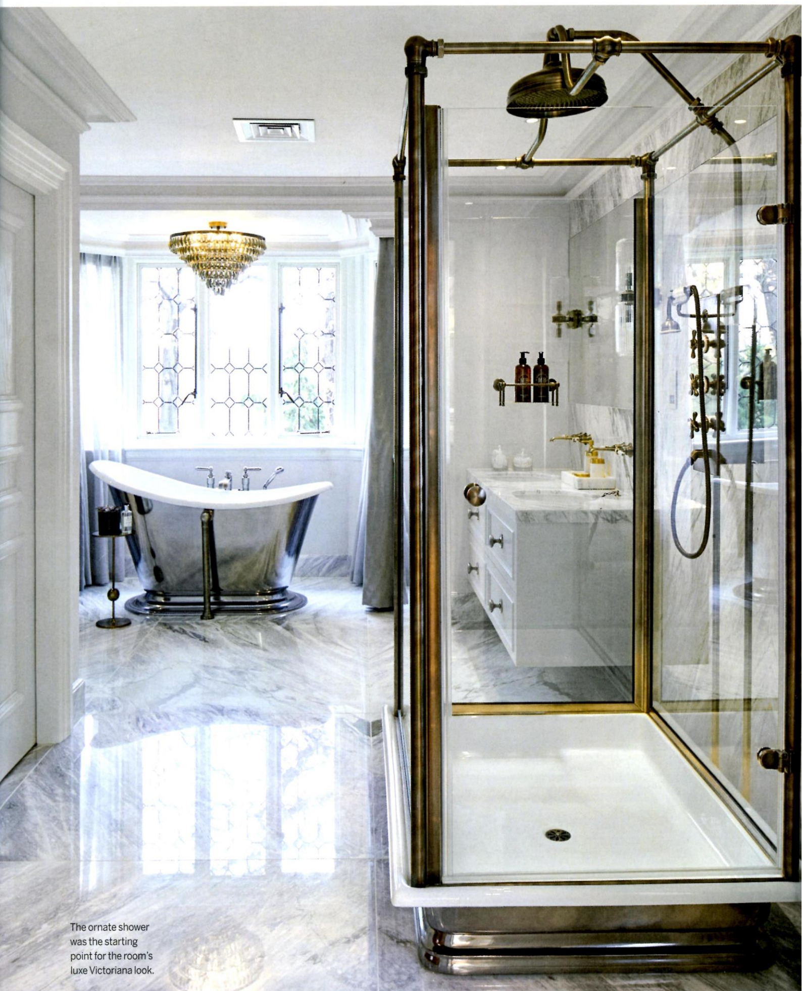
The ornate shower was the starting point for the room's luxe Victorian look.