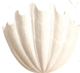
Plaster shell uplighter , £870, from Rose Uniacke