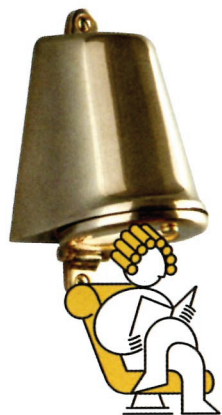
LED mast light (polished lacquered brass), £372, from Hector Finch