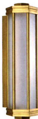
Glass ' Shot Light No 6 ' (antique brass), £2,746 for medium, from Collier Webb