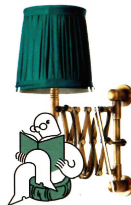
'Tina' brass wall fitting , £113; silk gathered lampshade (jade taj), £30; both from Pooky