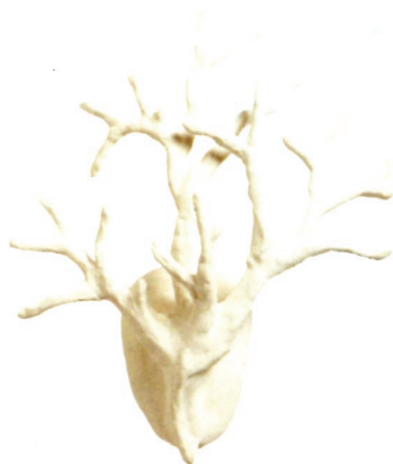
'Coral' resin wall light (white), by Viola Lanari for Balineum, £865, from Balineum