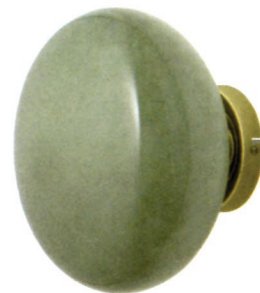
'Adrienne' glass and brass wall lamp (green), £75, from Made