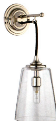
'Dalby' conical glass and brass light (polished nickel), £444, from Drummonds