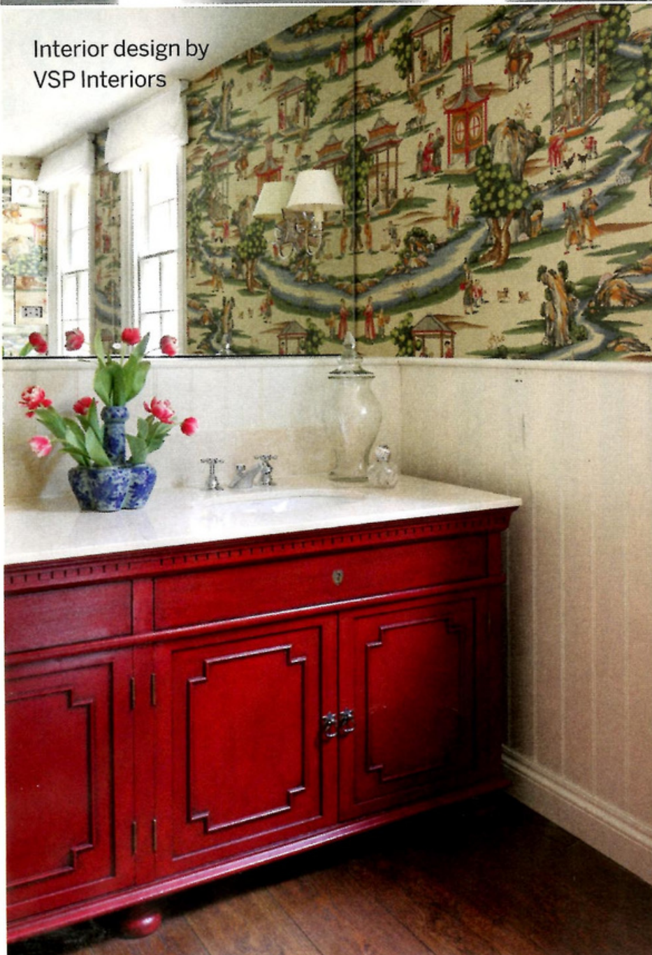
Interior design by VSP Interiors