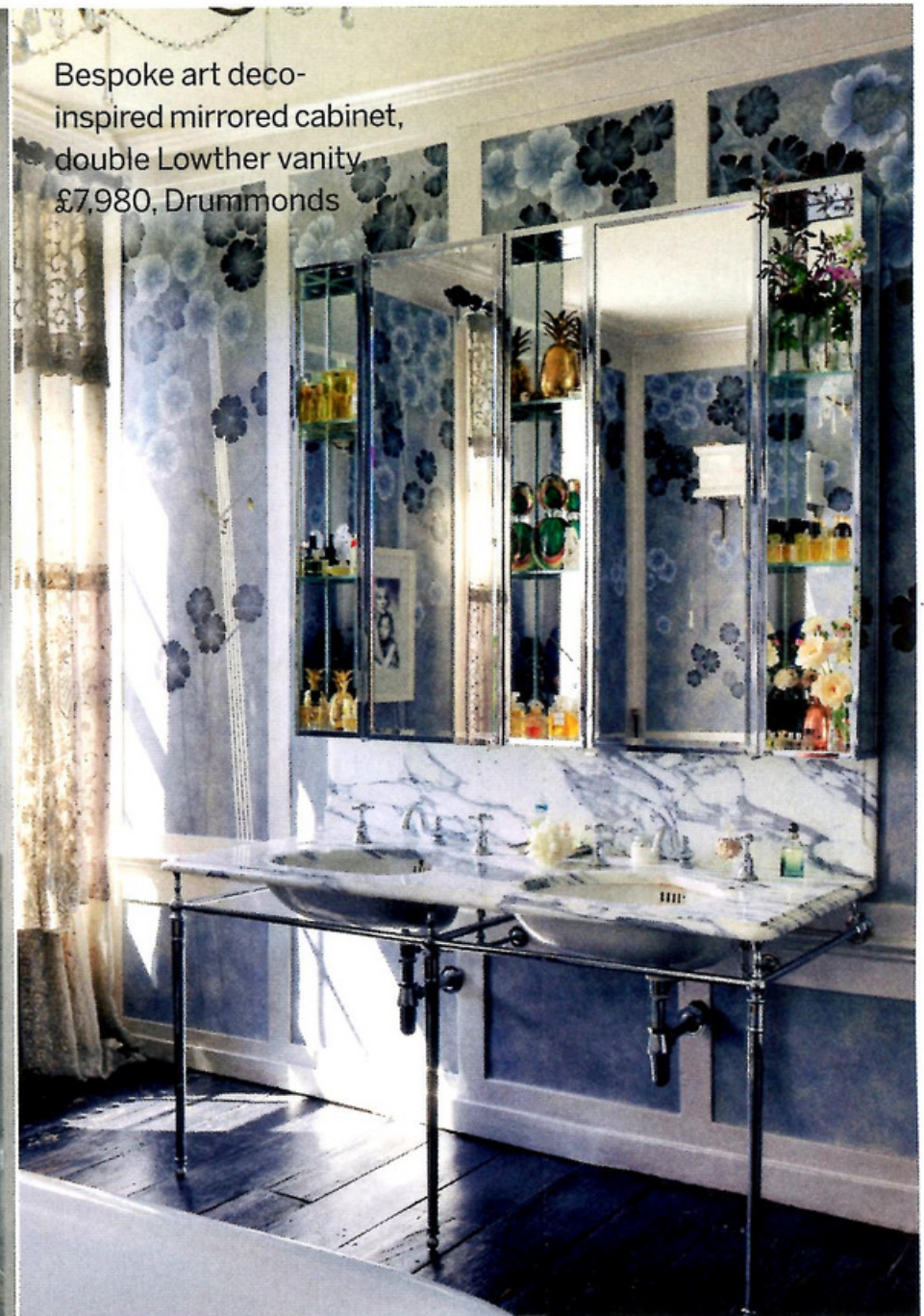
Bespoke art deco-inspired mirrored cabinet, double Lowther vanity, £7,980, Drummonds