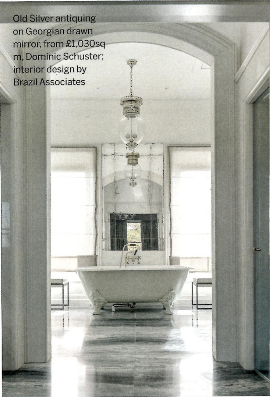
Old Silver antiquing on Georgian drawn mirror, from £1,030sq m, Dominic Schuster; interior design by Brazil Associates