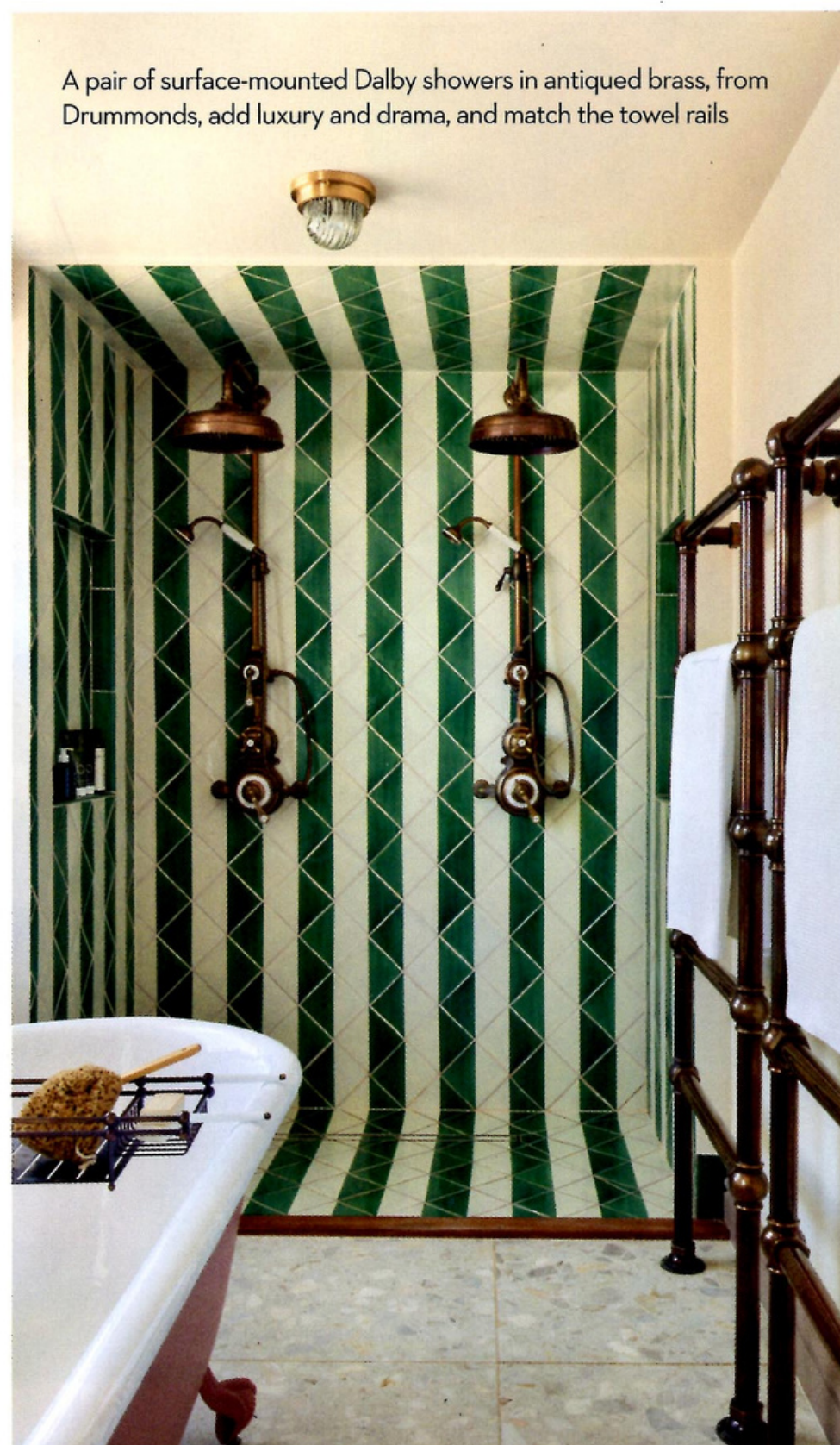
A pair of surface-mounted Dalby showers in antiqued brass, from Drummonds, add luxury and drama, and match the towel rails

Read has brought her expertise into play by confidently mixing colours and finishes to create an exuberant space. But this is not just a triumph of interior design: the bathroom has improved the quality of life for the whole family – and that makes it a resounding success. ■