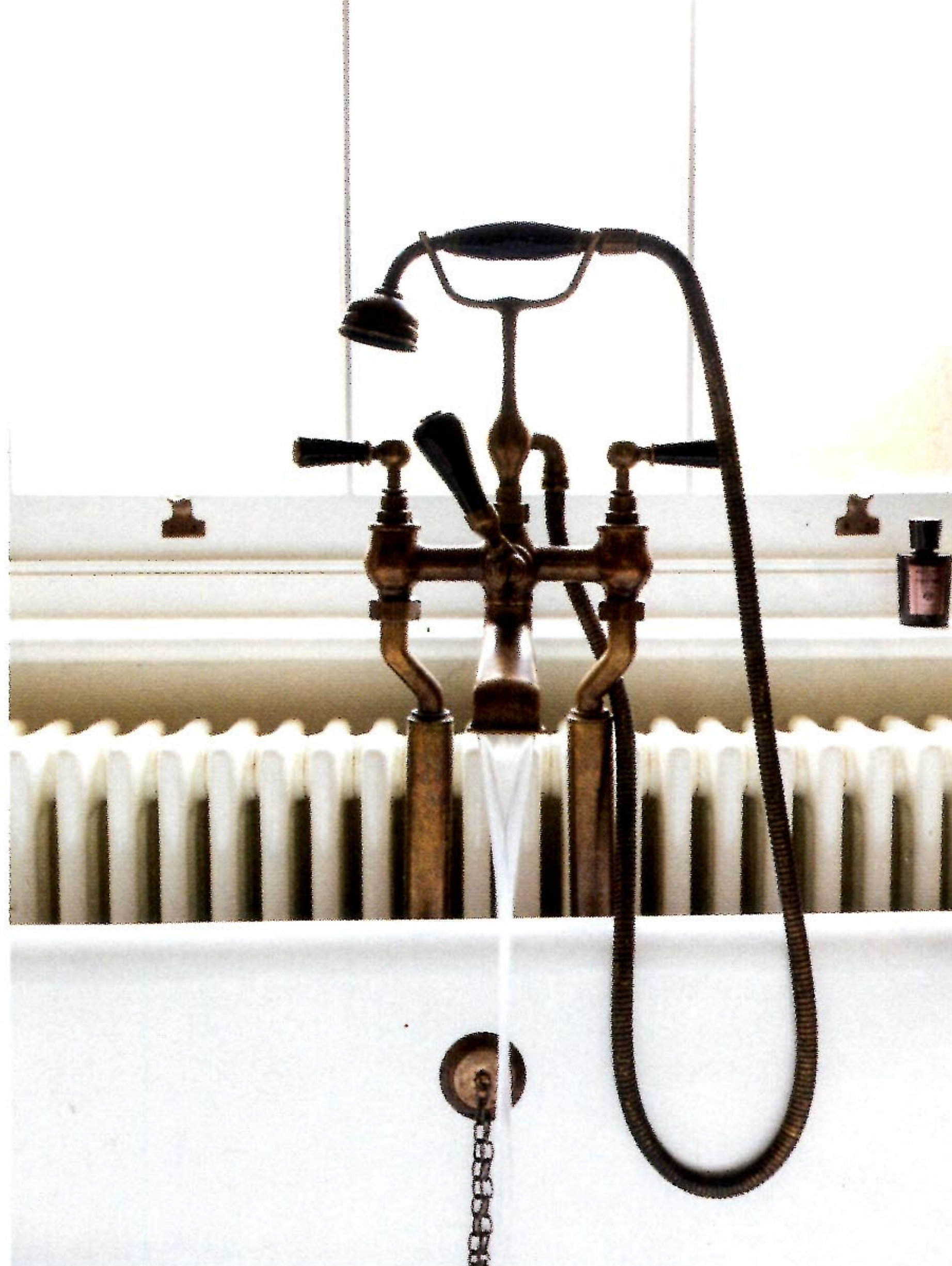
left The bath shower mixer, in Taunton finish with black ceramic lever handles, is from Lefroy Brooks.

4 Shower The enclosure has been positioned to make the most of an alcove at one end of the room.