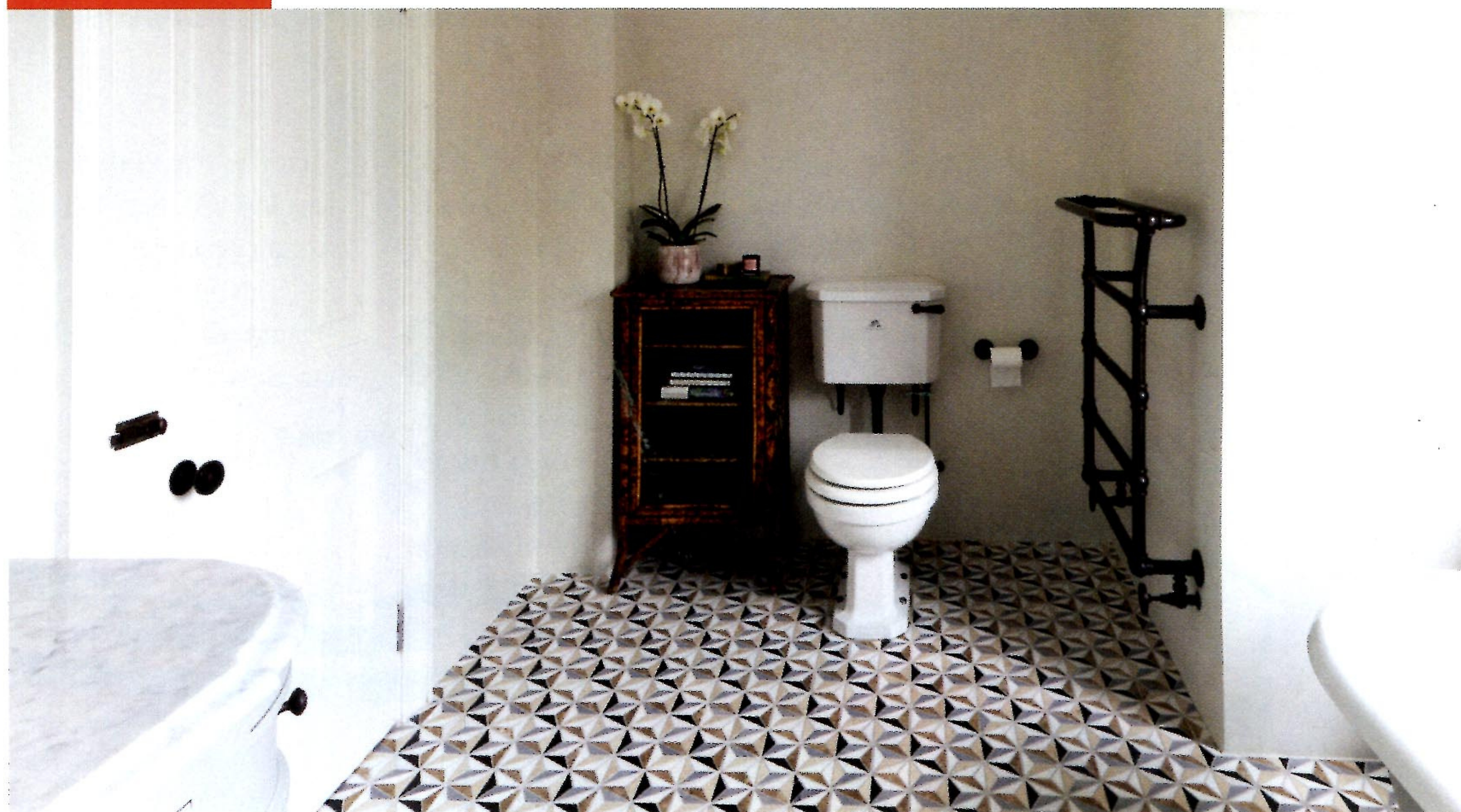
below The WC, from Lefroy Brooks, has been tucked behind the door for privacy. Towel radiator, Bard & Brazier; mosaic flooring, Artisans of Dezives.