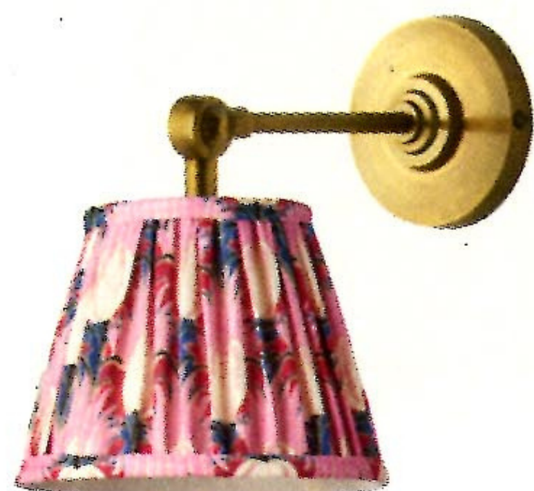
Elbow IP44 wall fitting, £95, with 18cm Empire shade, £34, Pooky (020-7351 3003; www.pooky.com )