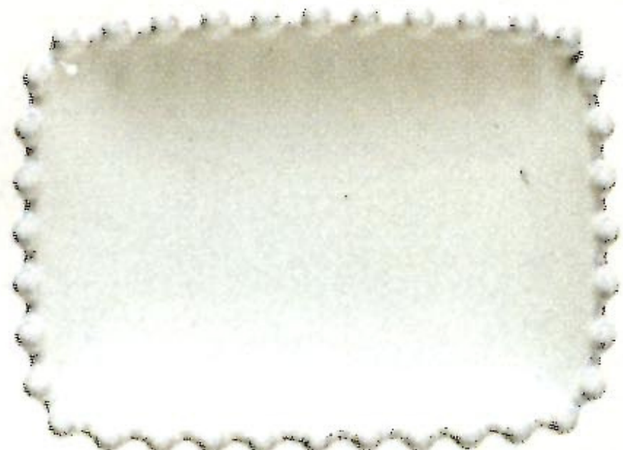
White Raised Dot soap dish , £12, Marquis & Dawe (01925 767611; www.marquisanddawe.co.uk )