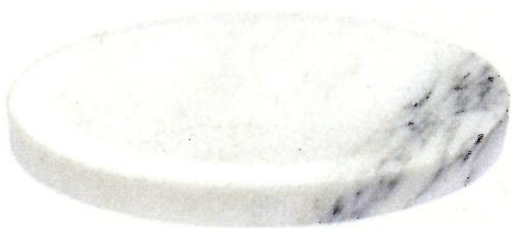
Arabescato marble soap dish , £114, Drummonds (020-7376 4499; www.drummonds-uk.com )