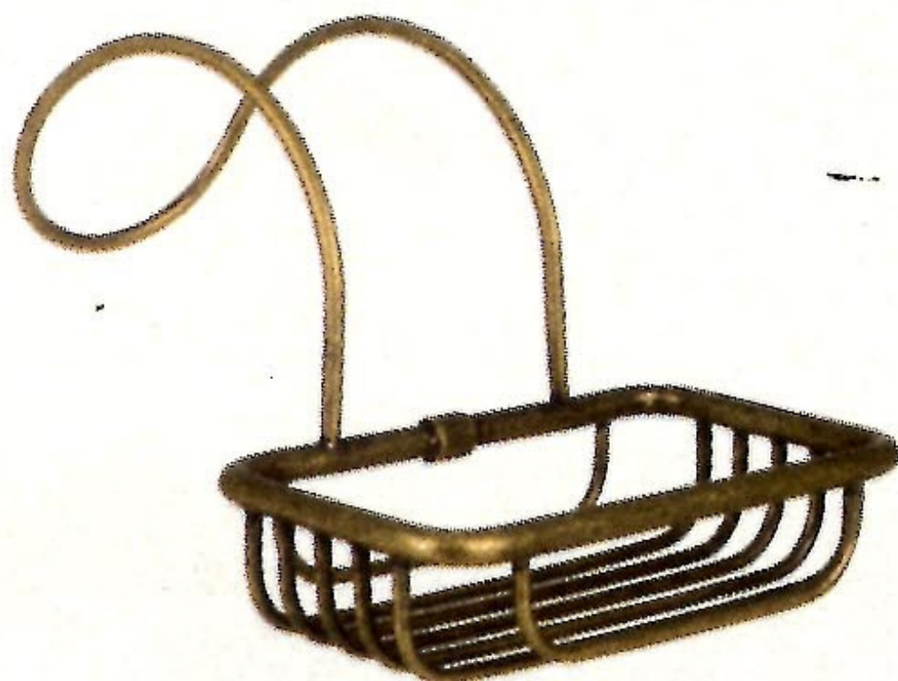
Stratford Roll Top soap basket , in Antique Brass, £37.40, Jim Lawrence (01473 826685; www.jim-lawrence.co.uk )