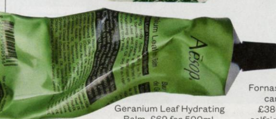
Geranium Leaf Hydrating Balm, £69 for 500ml, at aesop.com