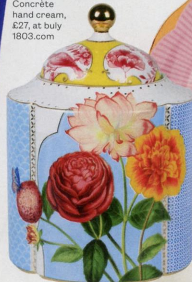
Pip Studio Royal Pip storage jar, from £30, at amara.com