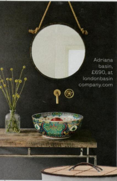
Adriana basin, £690, at londonbasincompany.com