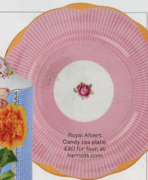
Royal Albert Candy tea plate, £80 for four, at harrods.com