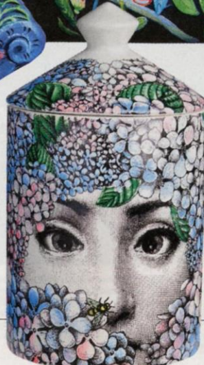
Fornasetti candle, £380, at selfridges.com