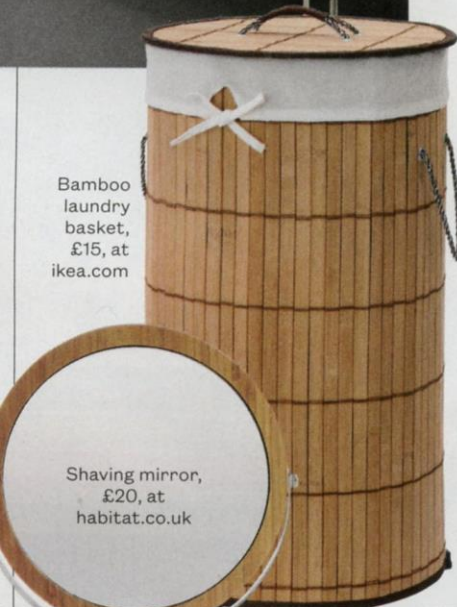
Bamboo laundry basket, £15, at ikea.com