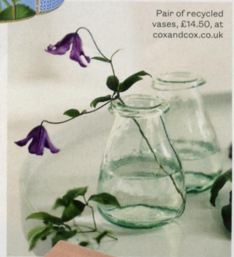
Pair of recycled vases, £14.50, at coxandcox.co.uk

Despite being one of the most used rooms in the house, bathrooms are often the most neglected in terms of style. A statement feature is the easiest way to add grandeur to small and humble spaces; Drummonds' cast iron bath is hand-painted with flowers and birds and will make any bathroom sing, while the London Basin Company has a striking collection of exquisite porcelain sinks, any of which will add style to the plainest of spaces. Pair bold statement pieces like these with more muted items in wood and bamboo. To reduce unsightly clutter, display products that are both functional and attractive. Conceal superfluous clutter in a vibrant storage jar, leave your jewellery on a decorative plate, and weigh yourself on bathroom scales that are chic and minimalist.