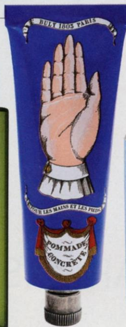
Pommade Concrète hand cream, £27, at buly1803.com