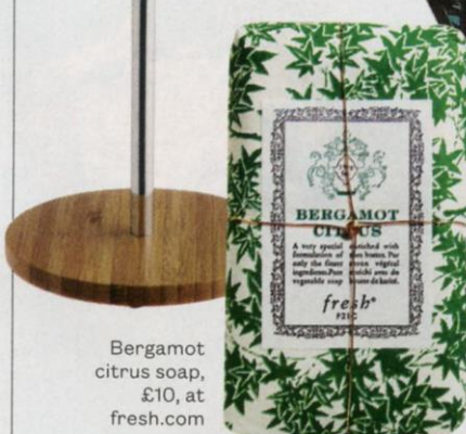
Bergamot citrus soap, £10, at fresh.com