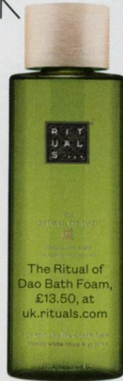
The Ritual of Dao Bath Foam, £13.50, at uk.rituals.com