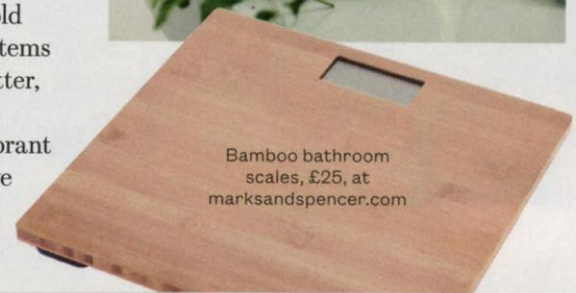
Bamboo bathroom scales, £25, at marksandspencer.com